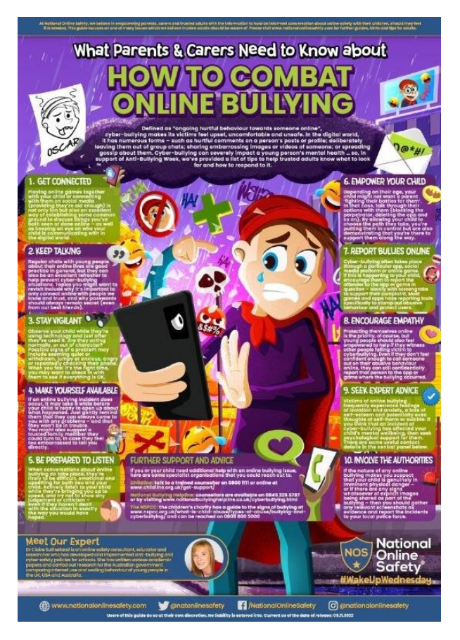
What Parents and Carers Need to Know about combating online bullying.

Defined as "ongoing hurtful behaviour towards someone online", cyber-bullying makes its victims feel upset, uncomfortable and unsafe. In the digital world, it has numerous forms – such as hurtful comments on a person's posts or profile; deliberately leaving them out of group chats; sharing embarrassing images or videos of someone; or spreading gossip about them. Cyber-bullying can severely impact a young person's mental health ... so, in support of Anti-Bullying Week, we've provided a list of tips to help trusted adults know what to look for and how to respond to it.